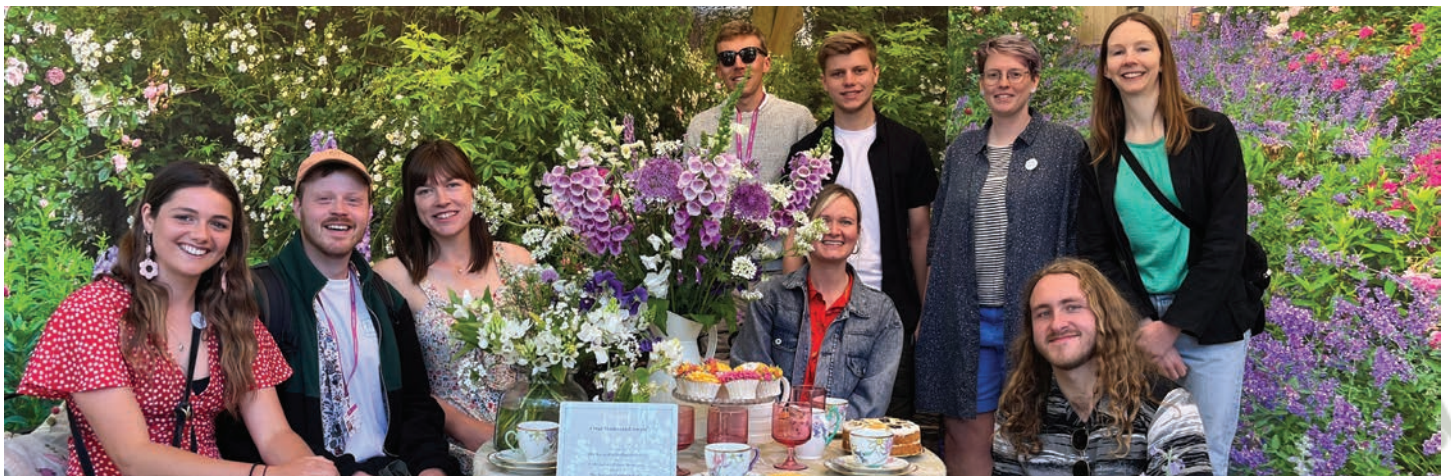
Trainees at the 2023 RHS Chelsea Flower Young Peoples' Breakfast