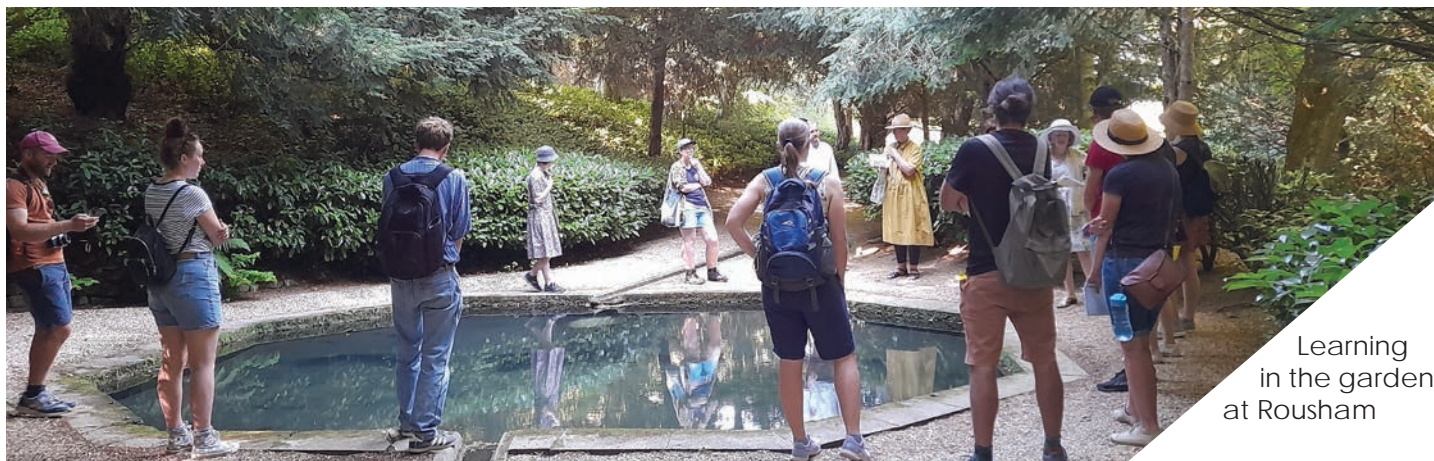
Learning in the garden at Rousham