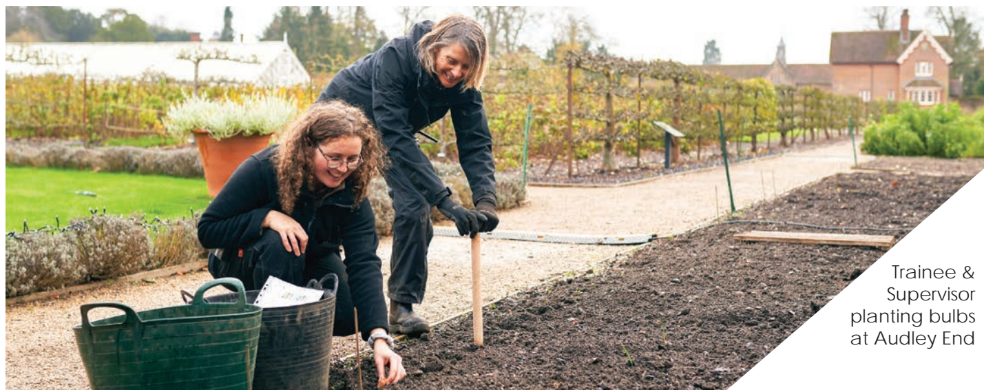
Trainee & Supervisor planting bulbs at Audley End

Your placement garden will provide you with induction training (covering all aspects of health and safety), personal protective equipment, and an employment contract. In addition, your placement garden will ensure that you have access to a computer and the internet whilst on site.