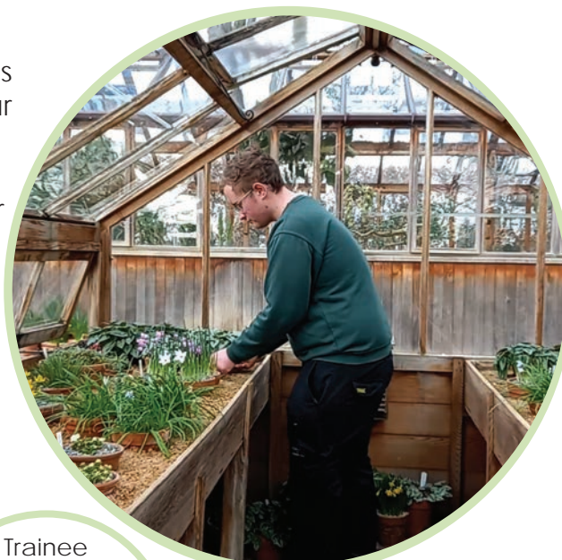
Trainee attending to plants in the Alpine House at Winterbourne House and Garden

The ITP is subject to change if opportunities arise for you to undertake additional learning via exchanges, conference attendance, etc.